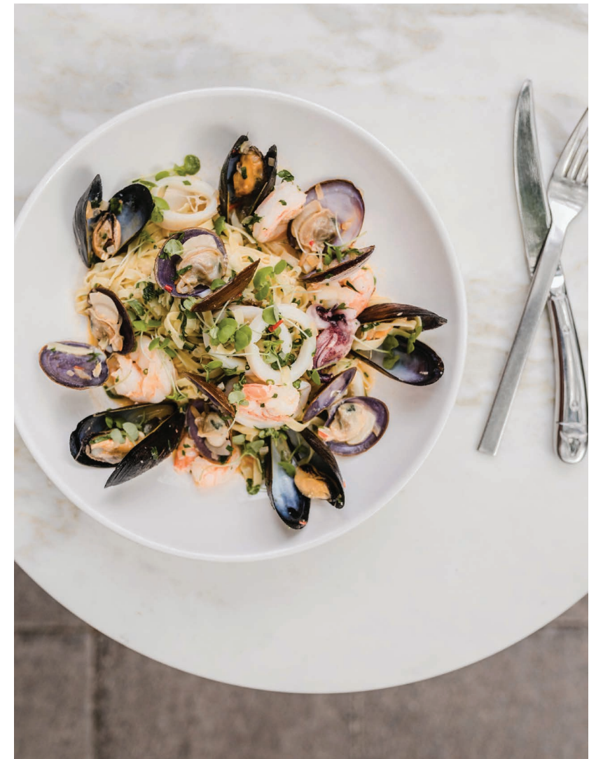
One Restaurant The Hazelton Hotel, 116 Yorkville Avenue